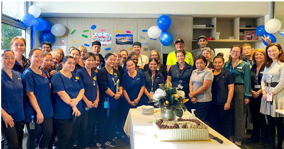
Alice Ross-King Care Centre