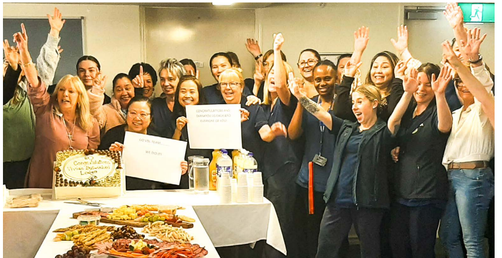
Vivian Bullwinkle Lodge