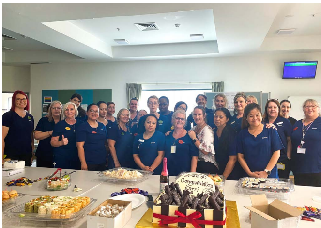
Karri and Tuart Lodge